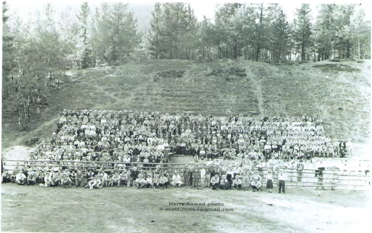
Jasper Rodeo at Whistler Campground in the early years

Rodeo has been offered in Jasper since 1925, well before the National Parks Act of 1930. Each year, we welcome Canadians and visitors from around the world to experience and enjoy the cultural, indigenous and Métis history and heritage of the area. The Parks Canada Departmental Plan 2017-2018 states that “Parks Canada will continue to work with Indigenous partners to ensure that the management of its natural and cultural resources integrates Indigenous traditional knowledge and respects Indigenous values and perspectives”.