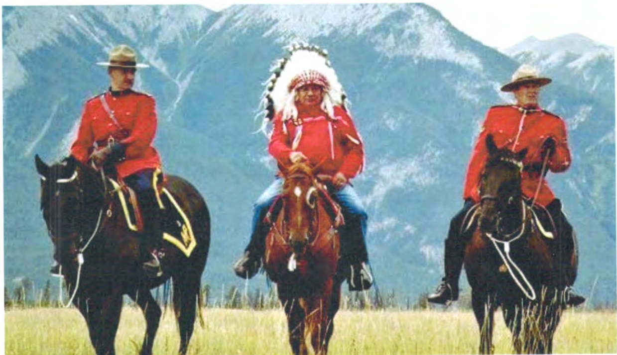
Jasper Heritage Rodeo 2015

The Jasper Heritage Rodeo derives from the pack-horse trains which opened the west during early exploration and the fur trade era, the survey parties for the routing of railways across western Canada, early ventures of indigenous peoples, outfitters, mountain climbers, surveyors, geologists, biologists and the first tourists into the Rocky Mountains. Many of the early organizers and participants in the Jasper rodeo represented indigenous and Métis families, even after these families were required by Parks Canada to leave their homesteads in the Jasper area.