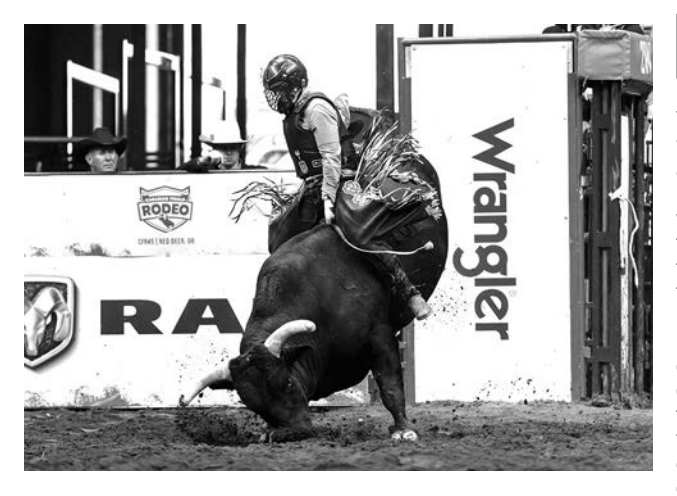
Bull of the Year -201 Night Moves, Calgary Stampede, Calgary, AB

N ight Moves is no run-of-the-mill bull. Granted, just being chosen Bull of the Year launches him into a whole new stratosphere and a place in the record books, but to garner the votes of some of the toughest bull riders in the world after only eight trips says a lot about the moves he makes.