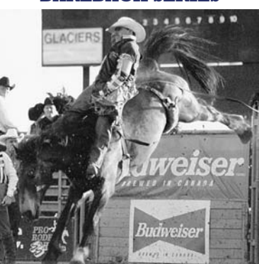
Final Season Standings